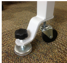
Caster & Leveling Foot