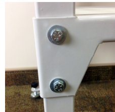
Easy Bolt-together Assy

Our PR Stands are in stock, securely packaged and ready to ship to your location.