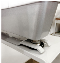
Lock down Bracket