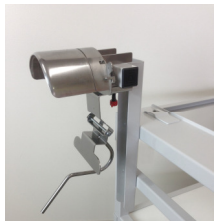
Framing Gage Support

HOOP TECH was the DESIGNER and ORIGINAL producer of the machine stands for the PR-600 machines. The rugged design, stability and ease of assembly has made it a standard in the industry. Features include, a large shelf, height adjustable framing gage support, lock down brackets to securely attach the machine to the stand, easy rolling casters and leveling pads on outrigger brackets for added stability. The heavy duty stand is all steel construction with a durable powder coat finish and is made right here in the United States.